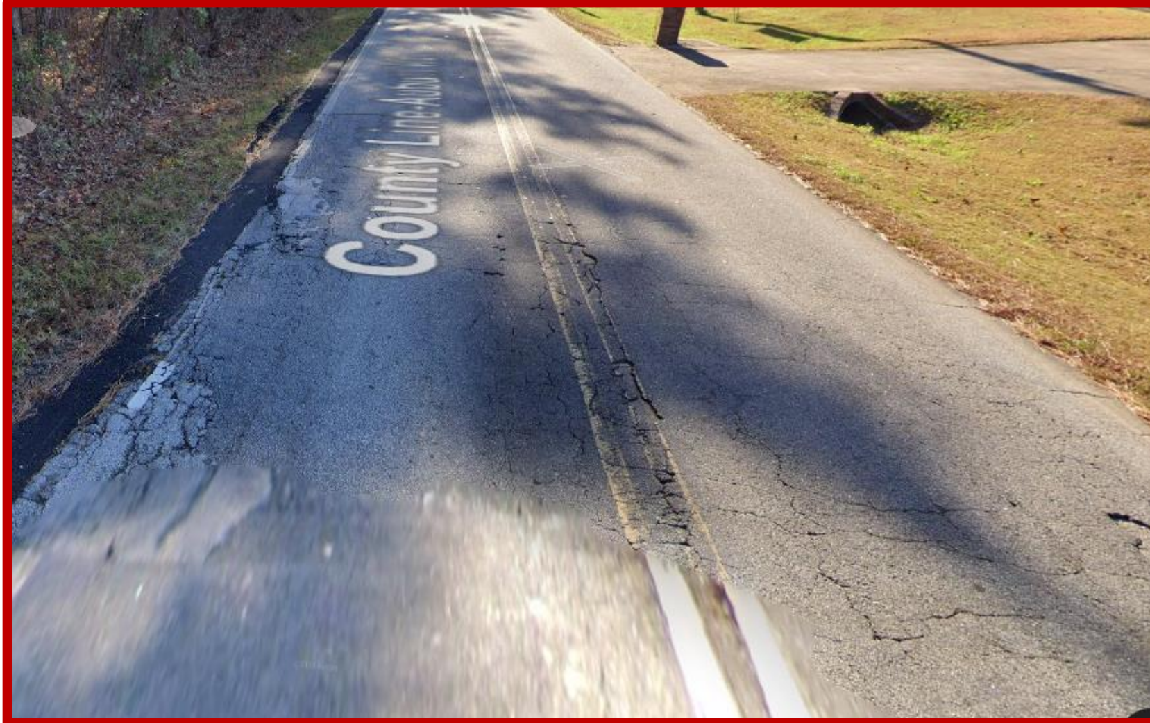
Longitudinal cracking along a major corridor.